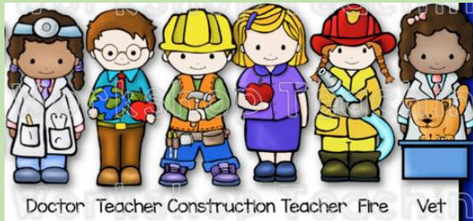
Doctor Teacher Construction Teacher Fire Vet

Address: 290B Bramford Way, Kennesaw, GA 30144 Office: (770) 919-1975/ Phone: (678) 324-1452/ 24 Hour Cell: (404) 542-7308 Website: https://www.starlightlearningacademy.com/ Email: starlightlearningacademy@gmail.com